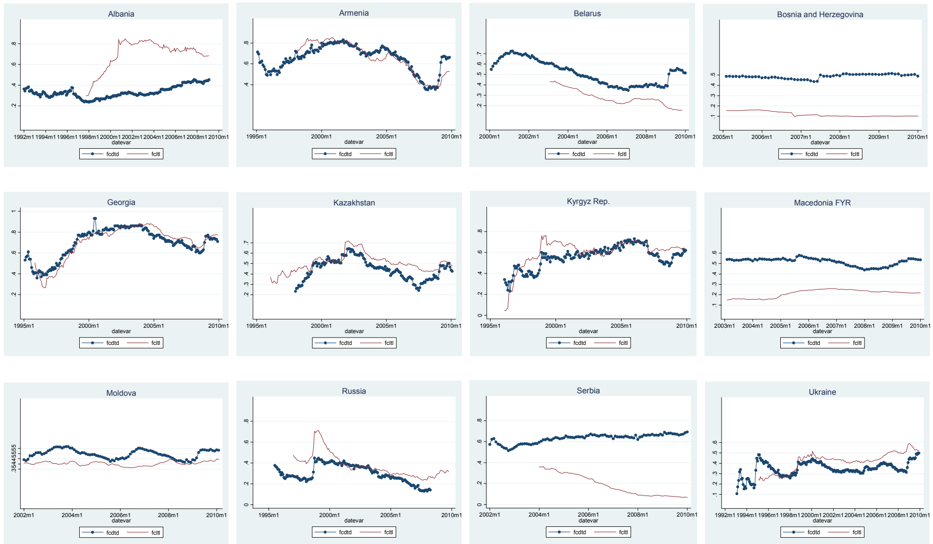
Figure 1a: Financial Dollarization of Non-EU Affiliated Countries