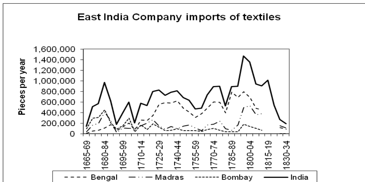
FIGURE 1: East India Company imports of textiles from India (pieces)