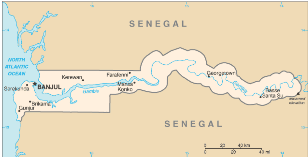
Figure 1: Map of the Gambia.