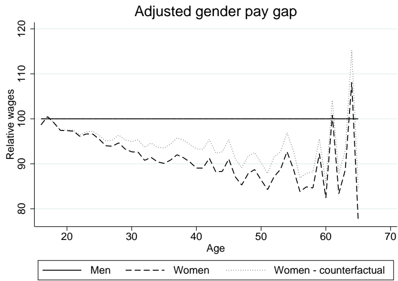
(b) By age