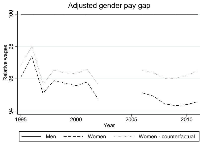
(a) Over time