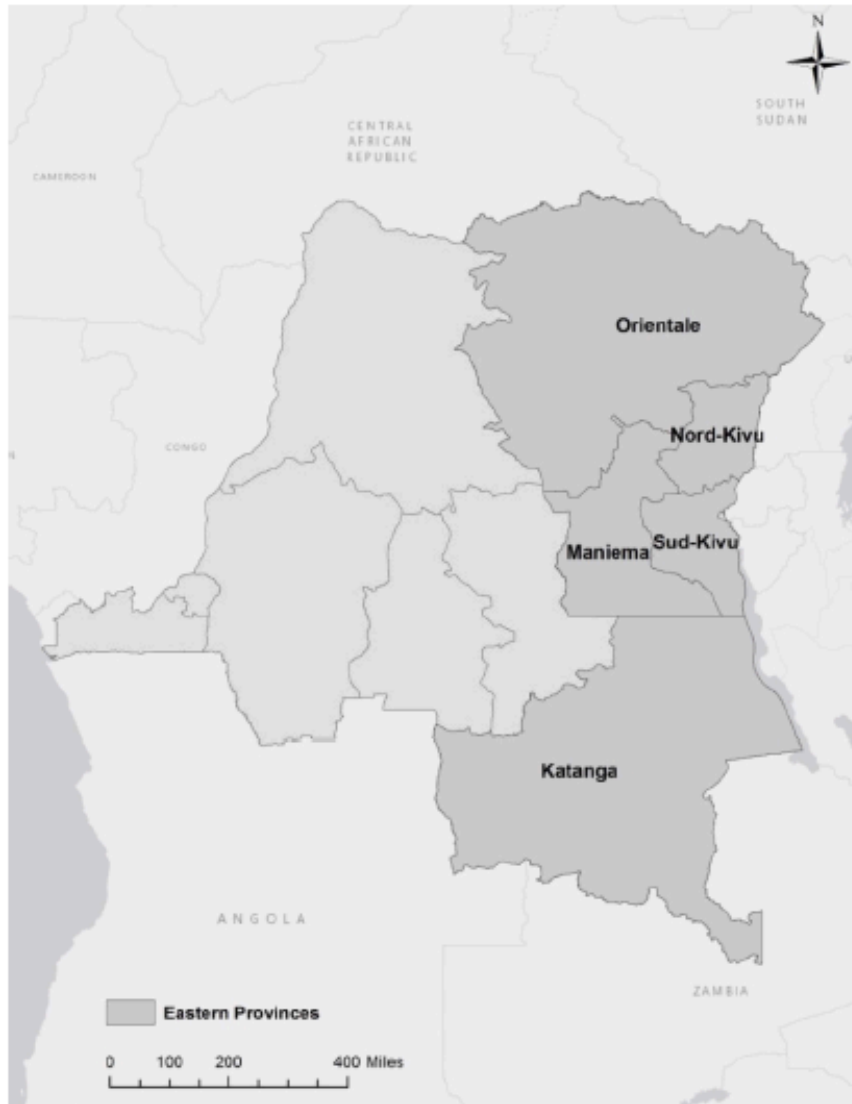
Figure 1: Map of Democratic Republic of Congo, Study Areas

Notes: Adopted from Parker, Foltz, & Elsea 2016. The shapefiles for province boundaries come from www.gadm.org/about